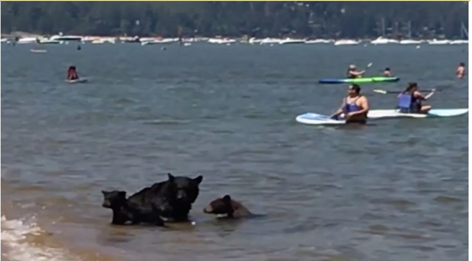
MAMA BEAR AND HER CUBS COOL OFF IN LAKE TAHOE