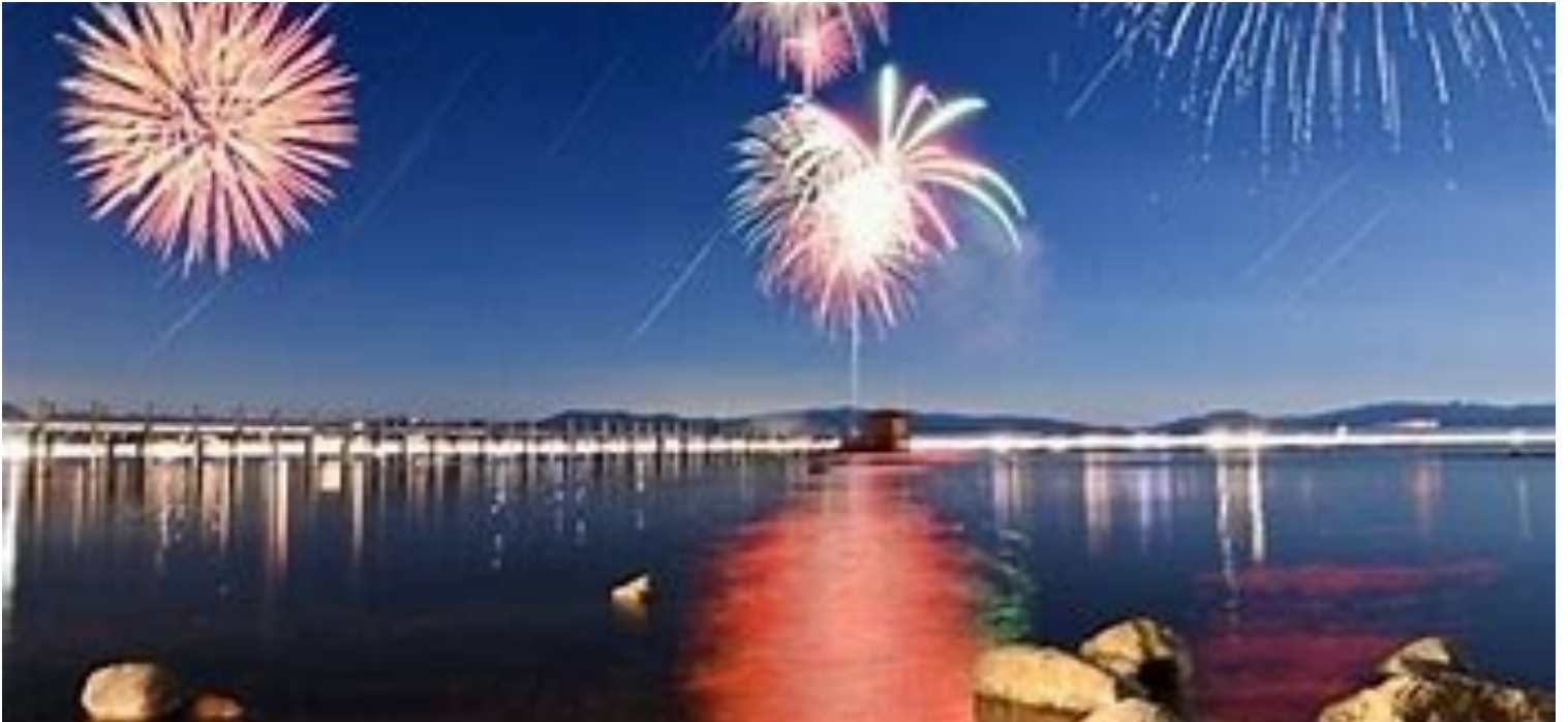
FIREWORKS OVER LAKE TAHOE

Happy 4th, Faith Lutheran! It's the month of the birthday of the United States, and what a blessing we've inherited to live in this democracy with its aim toward the "Blessing of Liberty to ourselves and our posterity" (from the Preamble to the Constitution). And what a responsibility we have to share, proclaim, and live this liberty for all!